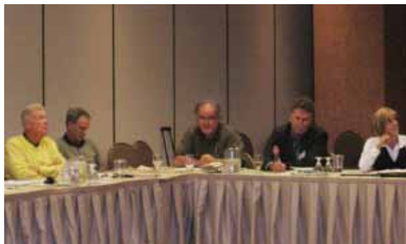
A meeting of the AGRSS Standards Committee will wrap up this year's conference, taking place at the Mandalay Bay Convention Center in Las Vegas.

This year's seminar line-up includes a range of topics from the much-anticipated updates covering various aspects of the AGRSS Standard to how changes in the automotive industry—such as new car designs or recalls and other safety issues—might affect safe